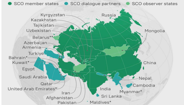
Map of member, observer, and dialog partner countries in the SCO (Sputnik Global, 2024)

Common interests heavily influence interactions between member states as prominent members of the SCO, China, and Russia are considered the organization's primary catalyst countries. China has been strengthening its presence in the SCO, primarily through its investments in energy security and infrastructure initiatives in Central Asia (Bilek, 2022: 39). Russia, on the other hand, is trying to increase its military and political influence in the region by emphasizing the security aspect of the SCO (Akin, 2024: 35).